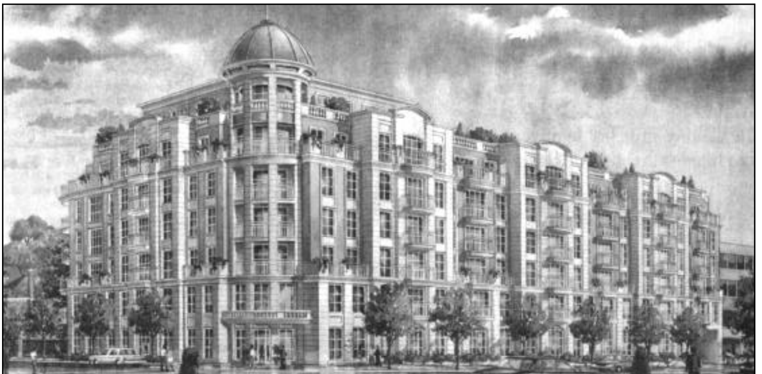
Mantella's Montgomery has a 1,315-square-foot penthouse with two walk-outs.