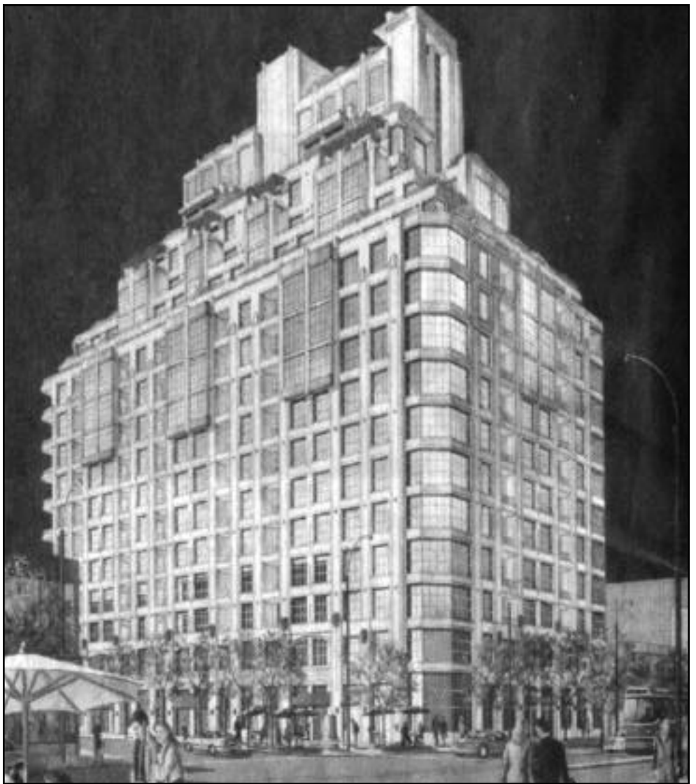
ILLUSTRATION: GREAT GULF

Of course, it's not just the core of the city where one will find penthouses of this exquisite quality. One of the most prestigious new condominium addresses in Toronto can be discovered by heading west to the Kingsway area.